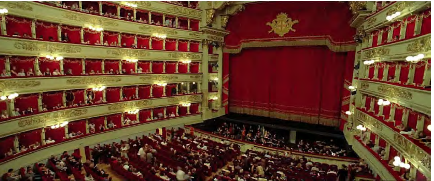
La Scala Opera House