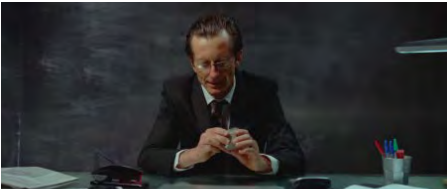
Paris... French performance artist Olivier de Sagazan. For more about Sagazan's work, visit http://nefdesfous.free.fr/