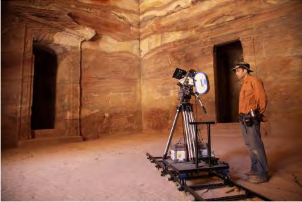
JC Earle monitors filming in Petra